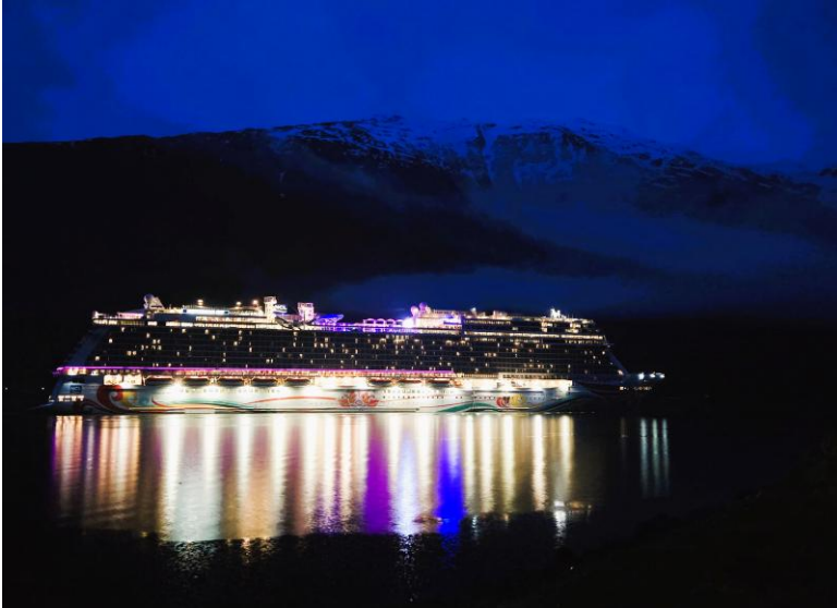
Norwegian Joy departs Juneau