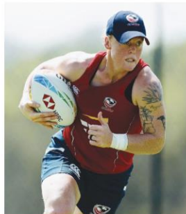
▲ Alev Kelter