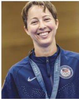
▲ Sagen Maddalena