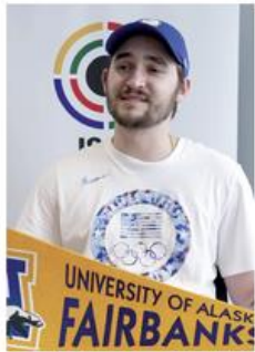
▲ Rylan Kissell Photo: @rylankissell